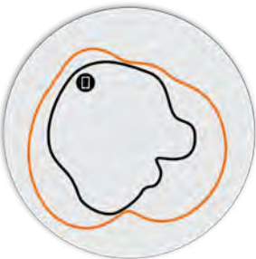
Figure 2. R350 2.4GHz Azimuth Antenna Patterns