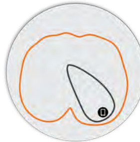
Figure 4. R350 2.4GHz Elevation Antenna Patterns