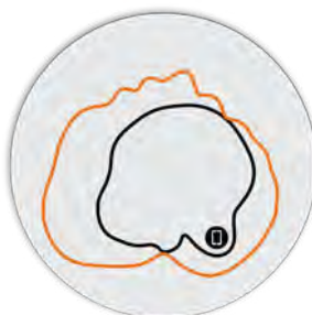
Figure 3. R350 5GHz Azimuth Antenna Patterns